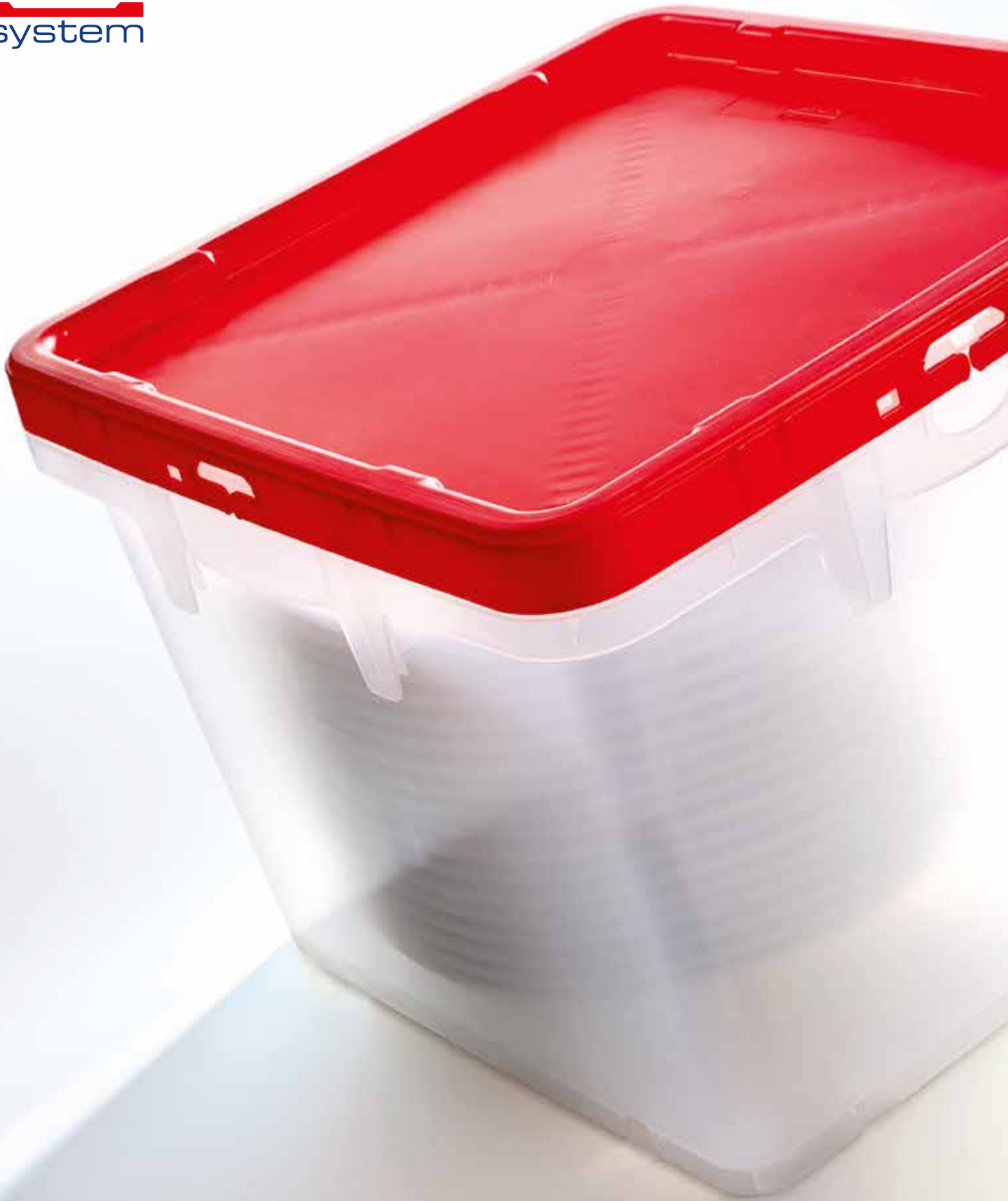
TRANSPORT BOX & EVENTPLATES