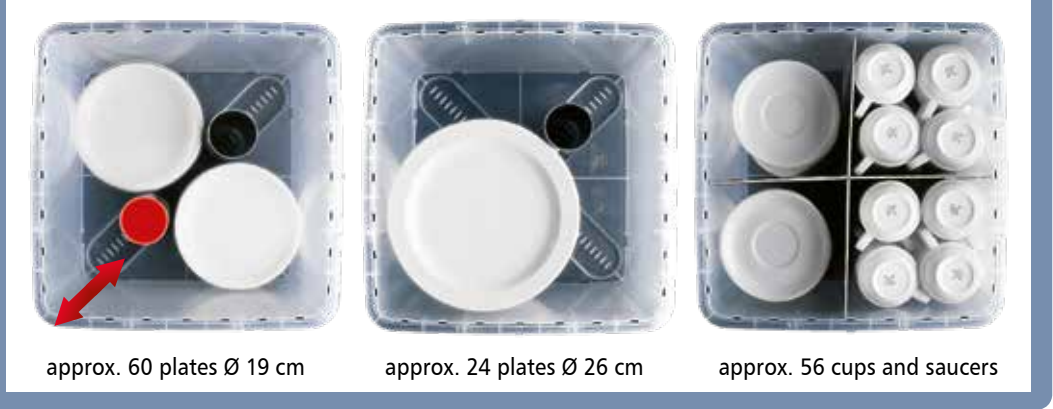
approx. 60 plates Ø 19 cm

Plates or even smaller items of crockery can be transported safely and easily using the Vary tool or appropriate dividers. The Vary tool is fixed by putting the lid on.