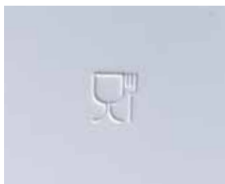
Approved for food contact