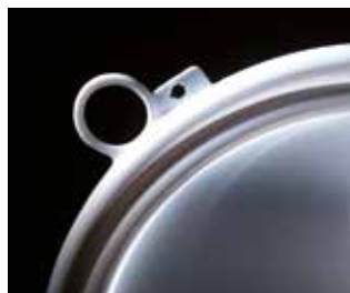
Lid with gripping lugs