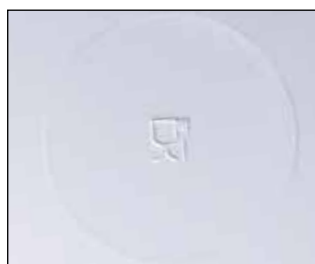
Approved for food contact